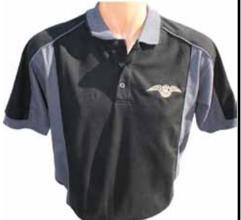
Polo Shirt $49 Black w-charcoal inserts Polycotton w/- embroidered logo S,M,L,XL,XXL,XXXL