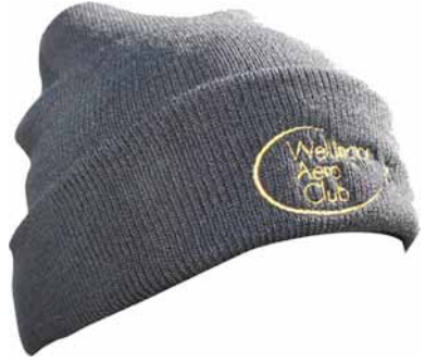
Beanie $13.00 Black poly-weave w- embroidered logo, universal fit.