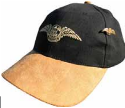
Jubilee Cap $19.00 Black w/- Tan suede peak, Universal fit.