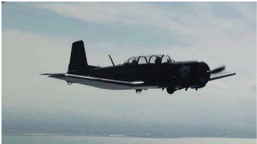
The Nanchang heading home over Cook Strait