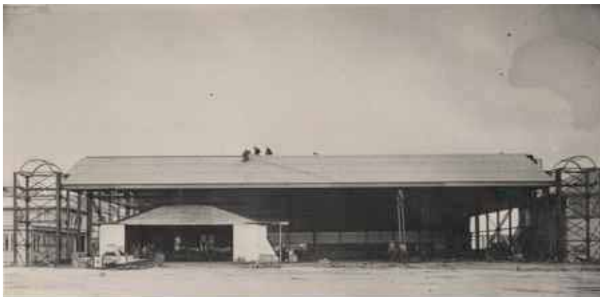
New hanger being built 1936. The original hanger is housed within the new structure.