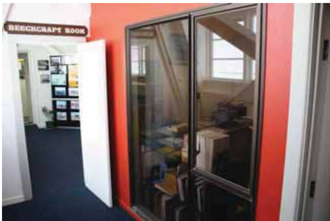
The newly created instructors room