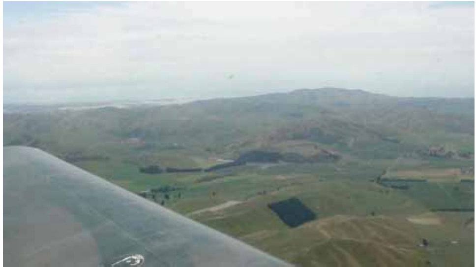
The Nanchang somewhere near Seddon (south east of Omaka)