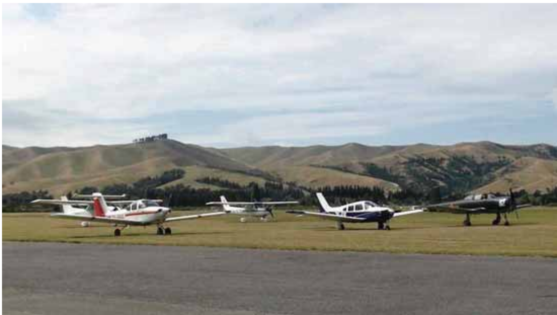
The planes parked up at Omana

After a solid day's flying from the instructors and members, it was time to head back to Wellington. A very enjoyable day!