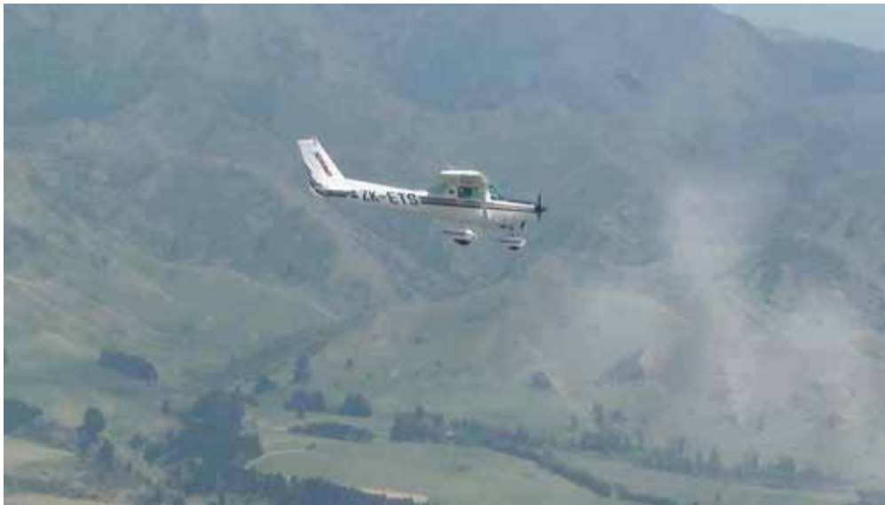
ETS (C152) getting set up for some spinning